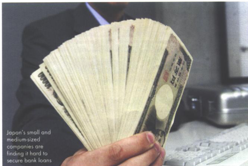
Japan's small and medium-sized companies are finding it hard to secure bank loans

The troubled retailer Daiei operates eight restaurants, seven hotels and a baseball team. The company is US$17 billion in debt and survives on a lifeline from its banks.