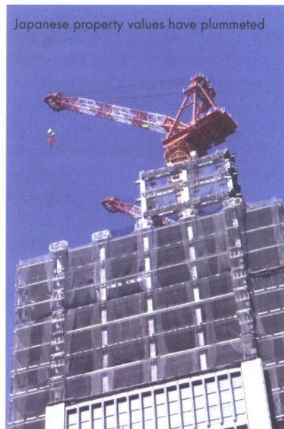
Japanese property values have plummeted

on manufacturing and now artificially propped up by near-zero interest rates. Along with the slump in demand, Japan is thought to be suffering from overcapacity, particularly in the construction and retail sectors. Many such companies are never likely to be profitable yet banks prop them up so that they will not go bankrupt, which, unfortunately, means resources are tied to low-return industries.